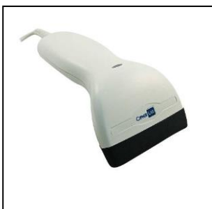
Cipher Lab 1000 $121.00 incl GST plus P&P 5 year warranty

These are the “workhorse” type barcode readers. They are always connected to the computer by a USB cable. The readers can be plugged into laptops as well as standard computers. Both are contact type readers, allowing them to be placed directly on top of barcodes. Ideal for student use as they can be held directly on top of labels.